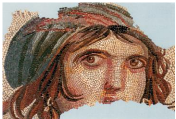
Gypsy girl mosaic at Gaziantep

LAND & AIR TOUR discounted to $9,900 per person (if deposit is paid by February 15 th , 2010)