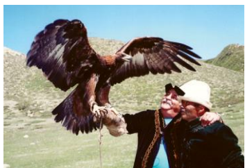
Eagle Hunt in Kyrgyzstan with Bora