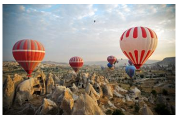
Hot air balloons over Cappadocia

LAND & AIR TOUR discounted to $6,990 per person (if paid in full by July 1st, 2010)